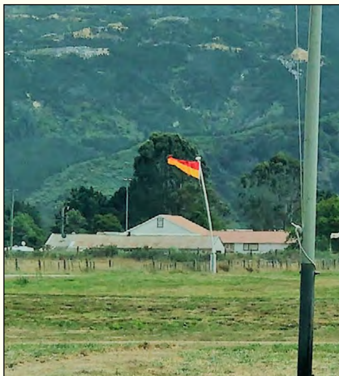
Very windy flag

This was a great trip and resulted in three wins in three Trans Tasman matches.