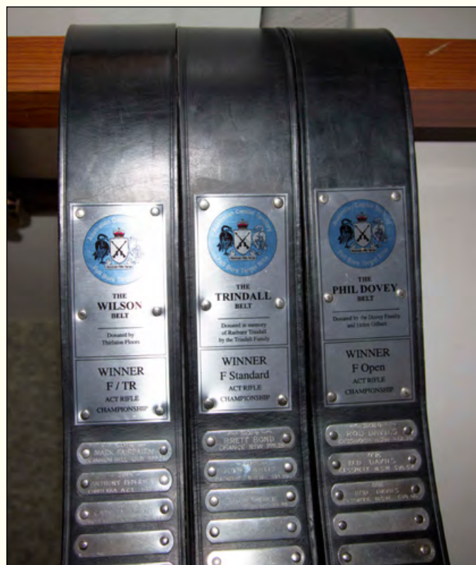
F Class perpetual belts

Day two opened with weather not much better than the previous day. Competitors were welcomed with 30 minutes of rain prior to the scheduled start. As the morning progressed through 600, light showers kept up for all of the morning and just about everyone got their fair share of wet weather at the two 600 metre matches. Competitors were spared the full strength of wind, however, the heavy flags managed to hide the actual strength of gusts, with competitors noting 1MoA Left to 2MoA left as a common wind setting across the mound. Despite a promising lifting of clouds looking north-east