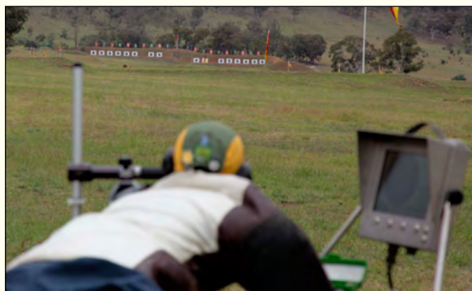
Kongsberg Electronic Targets across Canberra Rifle Range