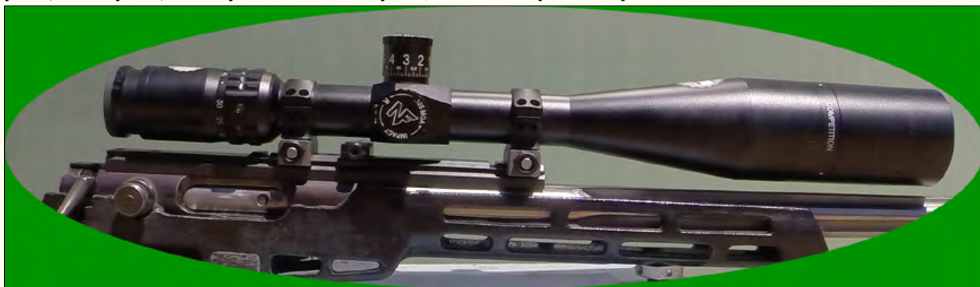
Nightforce competition riflescope

A few years ago, I purchased a NSX 5.5-22 long range scope from the South Australian Rifle Association. This scope was developed for the US military extreme long-range shooting. Being able to lower the magnification on heavy mirage days at ranges like Lower Light in South Australia was very helpful. The scope has 100 minutes of elevation and 60 minutes of windage. This scope was a pleasure to use.