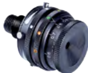
565 rearsight iris, 6-colour filter, two polarisation filters