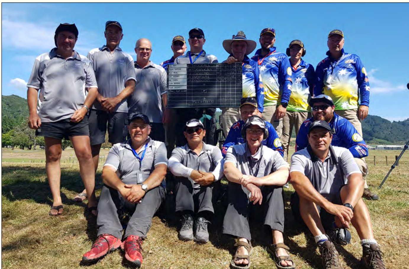
Australian and New Zealand F Class Open teams on the 1000 yards mound at Trentham

even more challenging than the morning, with mirage running left and right and very testing wind conditions. Again, the team followed our program, down and out as quickly as possible at 900 yards, finishing in 24 odd minutes, with a 14 point lead for that range.