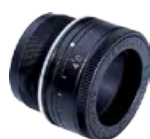
520 iris foresight