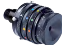
568 rearsight iris, 12-colour filter, two polarisation filters