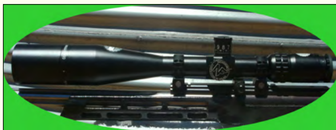
Nightforce 15-55X52 riflescope

The lenses located in the erector tube are used for magnification changes. When changes are made to elevation or windage, the erector tube is what you are adjusting. The lenses travel along internal raceways to adjust magnification. If a scope is not robust, the lenses can become misaligned, resulting in point of impact shift. The erector tube in all Nightforce riflescopes is secured to a snag-free gimbal system. This ensures that the adjustments you dial in will not shift under recoil.