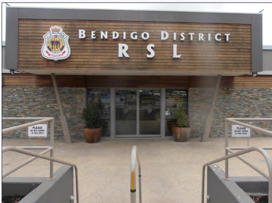
Major Sponsor Bendigo RSL