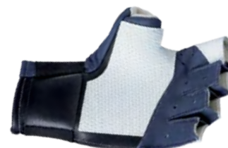
466 half-cover glove