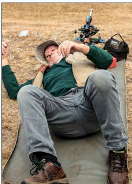
Having a nap