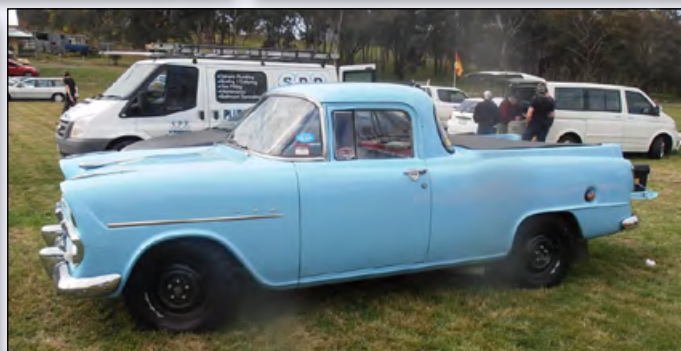
Old cars, old rifles, young and old having a lot of fun and experiencing our history in a unique and special way