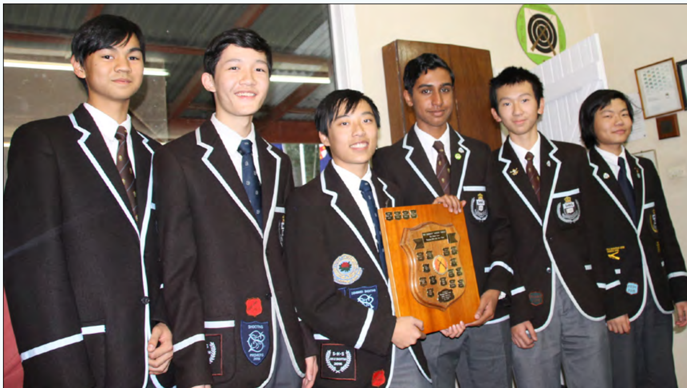
Competitors from Sydney Boys High School