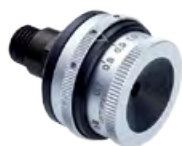
566-S rearsight iris, 6-colour filter