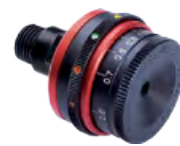
566-R rearsight iris, 6-colour filter