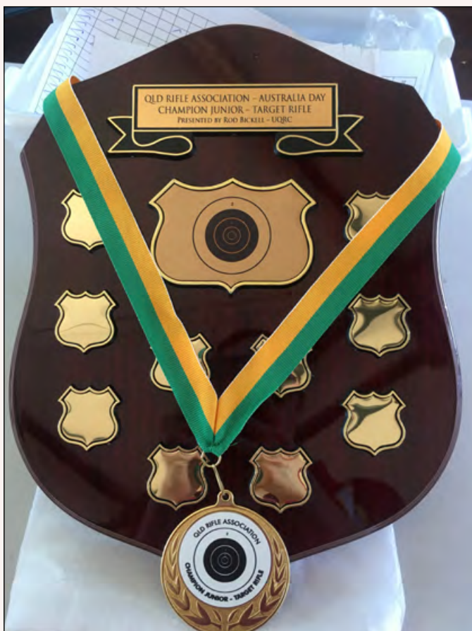
Champion Junior Trophy