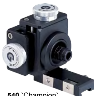
540 'Champion' see-through rearsight