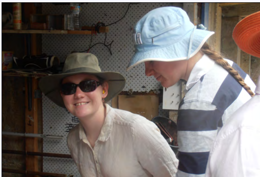
Helpful staff included