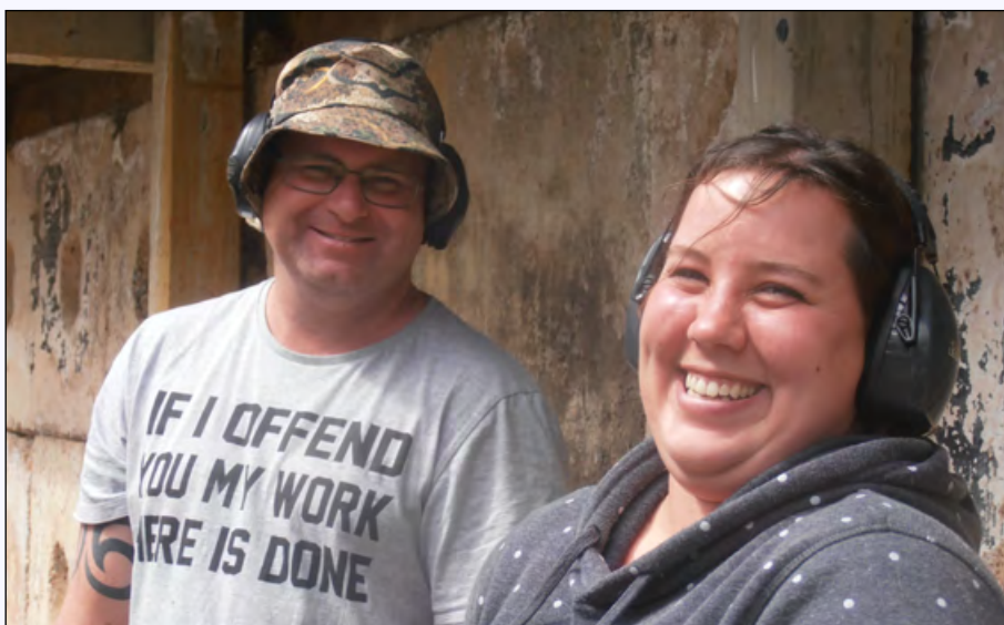
and butts officers