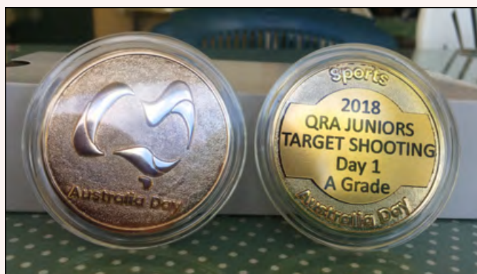
Australia Day Sporting Medals