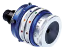
568MC rearsight iris, 48-colour and polarisation filter set