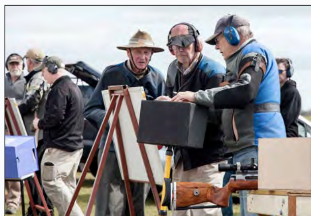
Three wise men