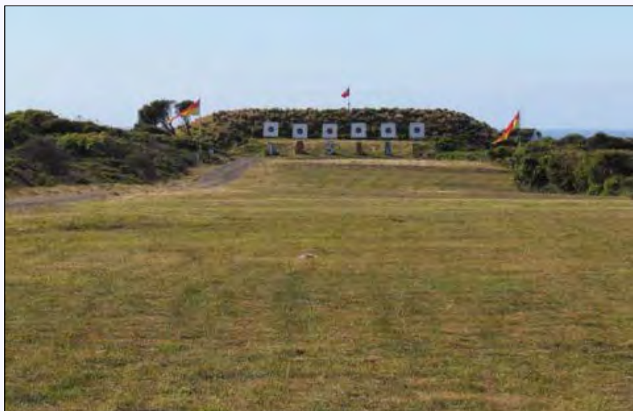
Port Campbell Rifle Club ready for competition