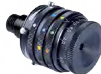
568 rearsight iris, 12-colour filter, two polarisation filters