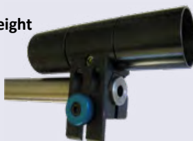
SUMO 30mm Height Adjustable Front Sight