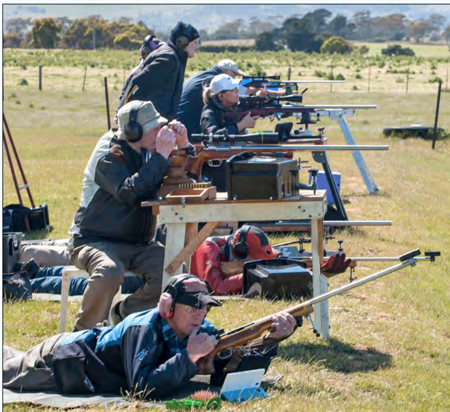
On the mound