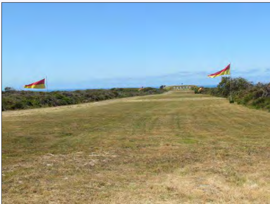
Fine weather for 2019's first prize meeting

The club would like to thank their club members for the efforts in