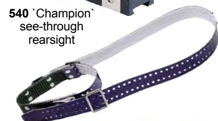
437 'pulse-free' sling