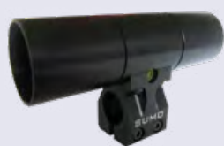
SUMO 30mm Fixed Height Front Sight

Contributing to the success of others in the sport, particularly in team shooting. The Australian team has been preparing diligently to compete in the Long Range World Championships for the PALMA trophy in NZ in February. We are well overdue for a win.