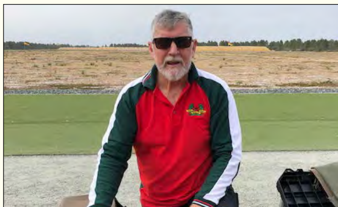
A Timms FTR