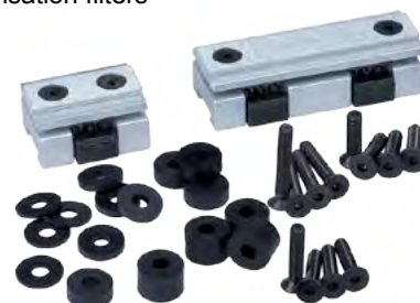
844 multi-height sight base set