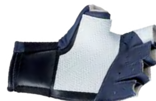
466 half-cover glove