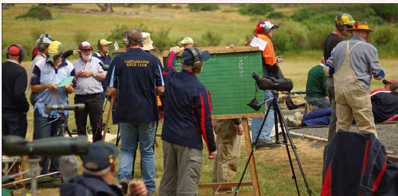
Activity on the mound at Castlemaine