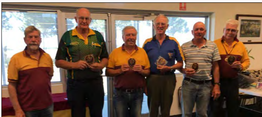
2018 FClass Winners