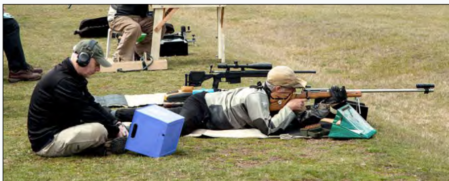
On the mound