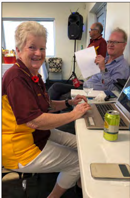
All smiles in Subiaco

Full results are available on the WARA web site.