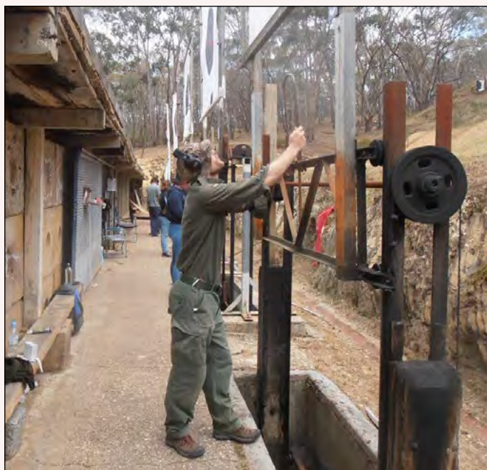
Markers at work