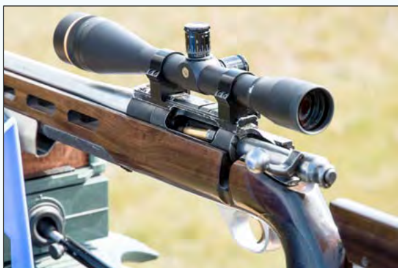
Good old Omark