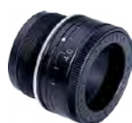
520 iris foresight