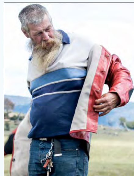
Where's the sleeve