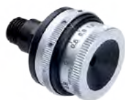
566-S rearsight iris, 6-colour filter