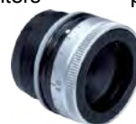
522-S iris foresight