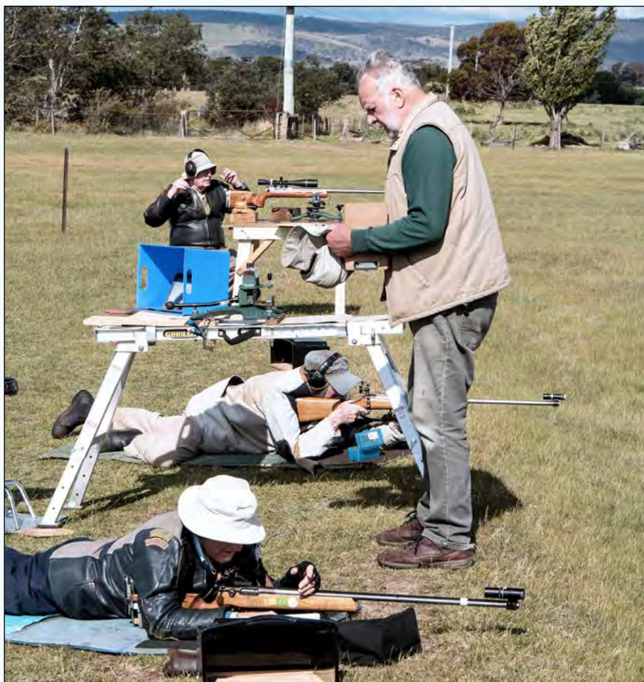
Remembering our friends