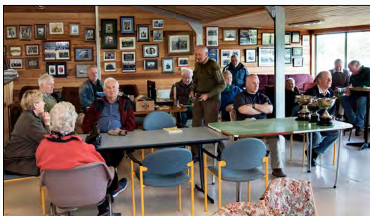
After the shoot