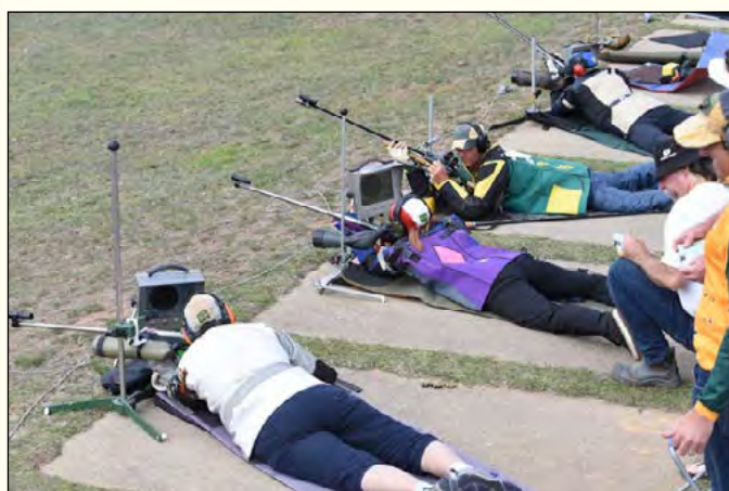
Kongsberg Electronic Target System in use Canberra Rifle Range