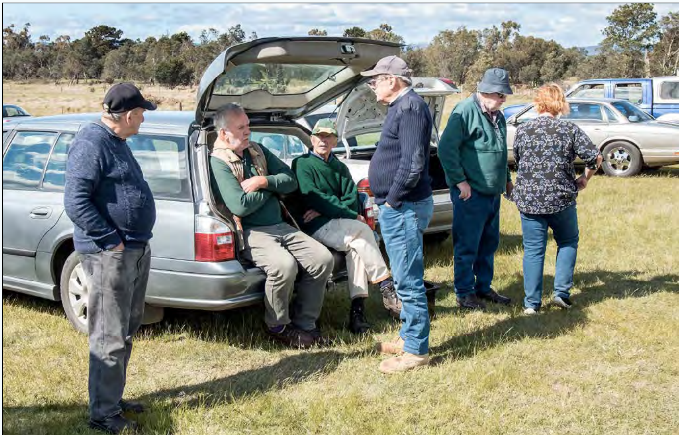
Chin wag time