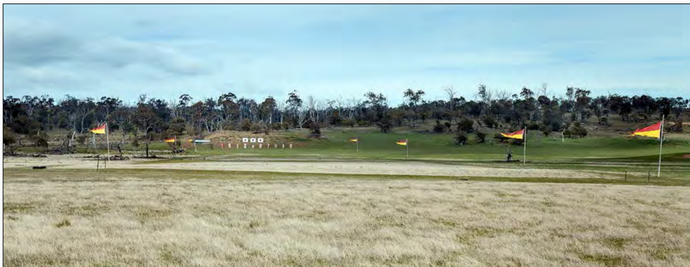
Campbell Town Range