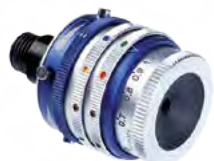
568MC rearsight iris, 48-colour and polarisation filter set