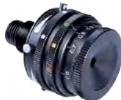
565 rearsight iris, 6-colour filter, two polarisation filters