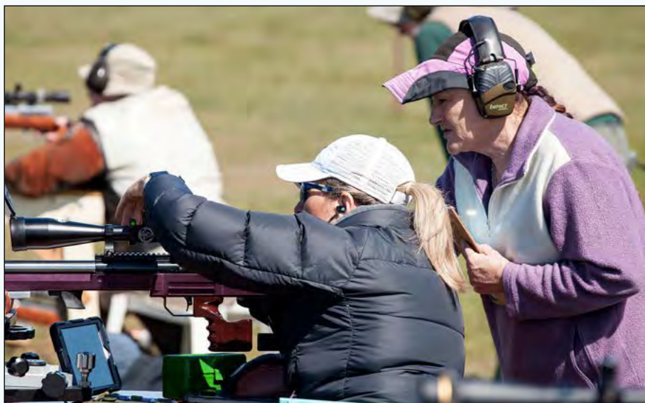
Helping a new shooter

With the year coming to a close, the TRA wish you all a safe and happy new year, and most of all, hope to see you at our Tasmanian Queen's in March. All the very best.