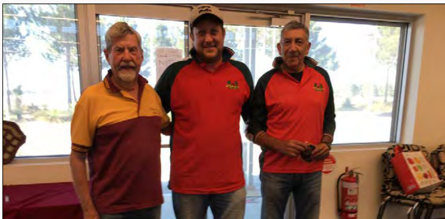
2018 FOpen Winners