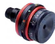
566-R rearsight iris, 6-colour filter