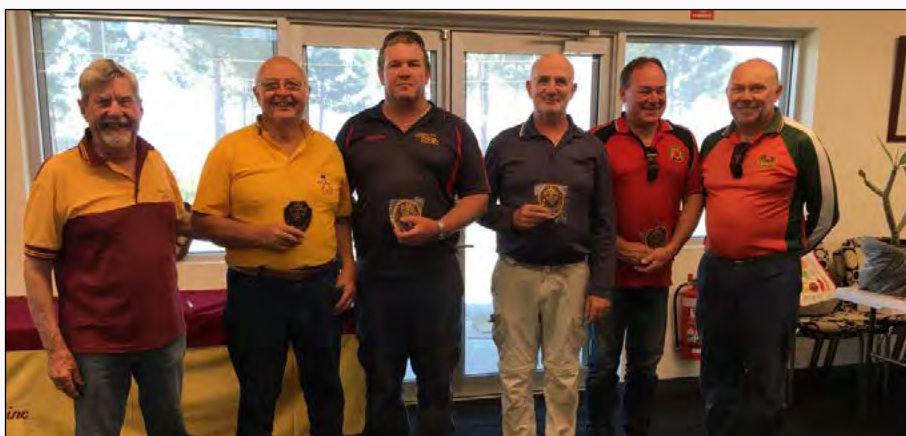
2018 TR Winners