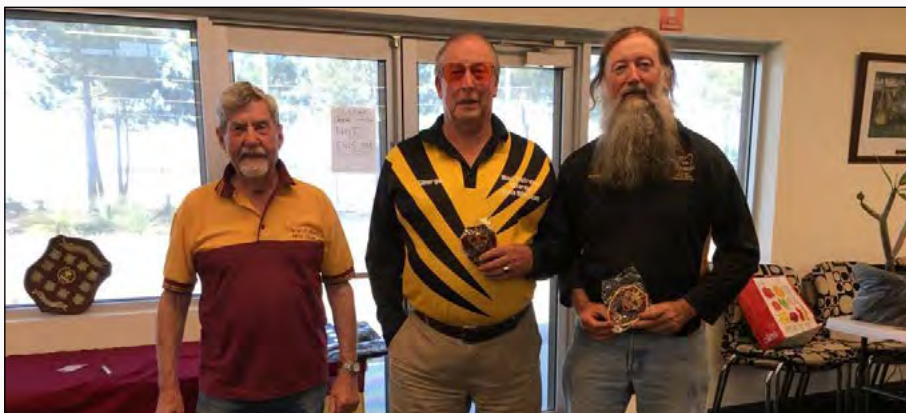
2018 FTR Winners